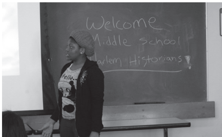
Figure 1. A student presenting her research in front of family, friends, and teachers at Teachers College, Columbia University.