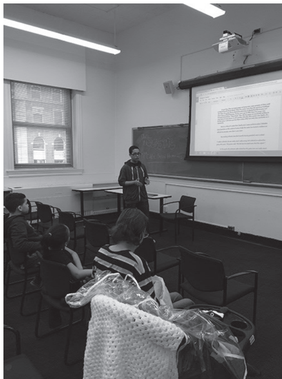
Figure 3. One student sharing his research in front of family (pictured here), friends, and teachers at Teachers College, Columbia University.